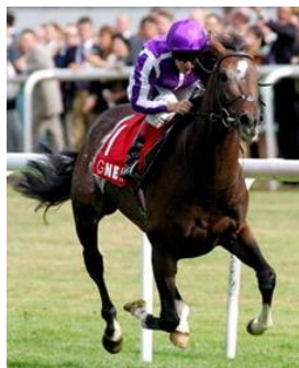
Septimus – Leading European trainer Aiden O'Brien 's Irish stayer is aiming to become the first battery-operated horse to win the Melbourne Cup.