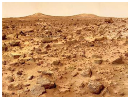
A picture of the Kahlin centre wicket taken moments after the 2008 D-Grade Final. The Palmerston Cheeses outlasted PINTS of Beer in a Titanic clash which left the batsmen with the sinking feeling as both sides notched up Bingo scores in a war of attrition.

This was the epic D-Grade Grand Final at Kahlin Oval, Palmerston managed to defend a Bingo score of 82 runs on a piece of land more resembling the surface of an asteroid than a cricket pitch to down PINTS, who crumbled like a twelve year old slice of bread after being in a seemingly match-winning position of 2-59. Wow! Had to see it to believe it!!