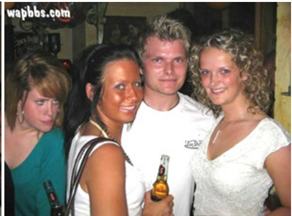
The Pepsi Max – one with the boys and one with the girls!